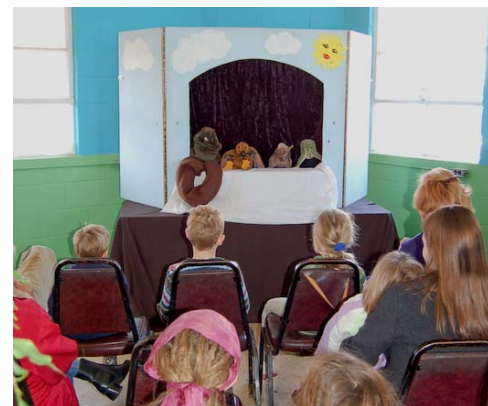
Groundhog Day Puppet Show with The Nature Zone

We want to thank everyone who came to these open houses and especially our partner, The Nature Zone of Lynchburg Dept. of Parks and Recreation.