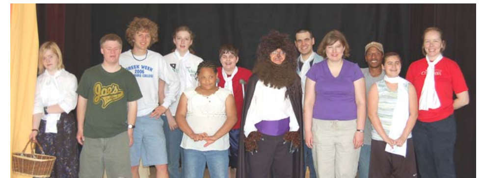
Lynchburg Grows Players during a Saturday afternoon rehearsal of Beauty and Beast in April 2008.

We are having a free performance of Disney's Beauty and the Beast for Friends and Family on Saturday, April 26th at 7:30 and Sunday, April 27th at 3pm. Please let us know if you plan to attend. Call to reserve a seat.