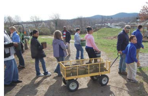
E.C. Glass High School Special Needs students help load and move freshly filled containers for Lynchburg Grows. The pots will be filled with herb and flowers seeds for us to sell in our Garden Shop in the coming months.

Lynchburg Grows gives my students (people with multiple disabilities...or as I like to say ABILITIES) a chance! The people that work at Lynchburg Grows are loving and patient with my students! My students have opportunities to see first hand how plants are produced, where fruits and vegetables come from, and how animals grow! I could never teach my students about the "life cycle of a plant" or the concept of "chickens and eggs" without the real life experiences they gain from Lynchburg Grows! It is truly evident to me that Lynchburg Grows is a place of life and opportunity!